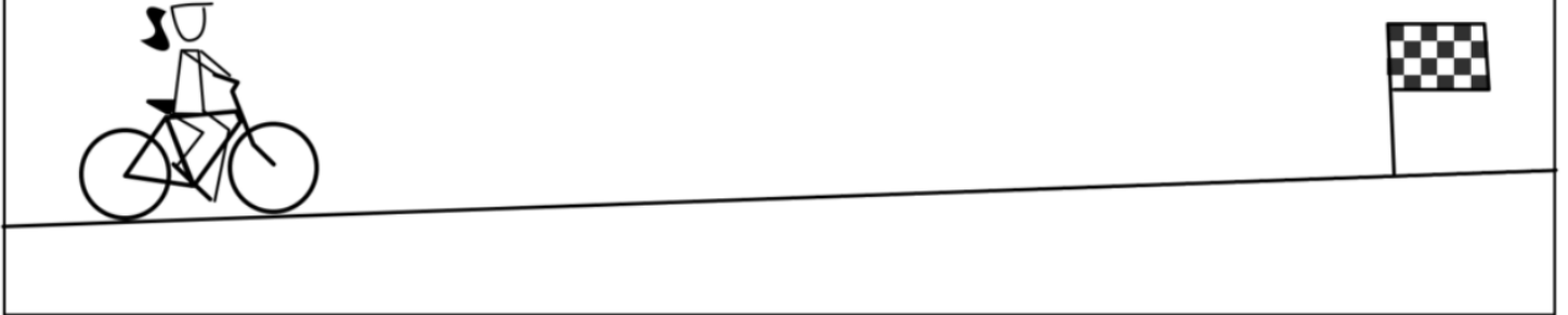
THE UNIVERSE'S PLANS FOR YOU