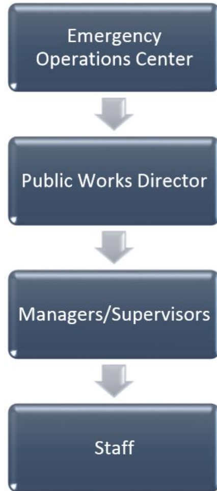
Figure 1 Establishing the Emergency Operation