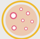
CONTACT WITH LESIONS