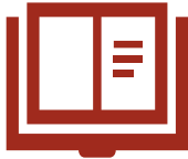
Research and Evaluation