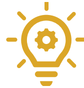
Innovation and Entrepreneurs hip