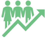
Economic Adjustment Assistance (EAA)