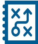
Trade Adjustment Assistance for Firms (TAAF)