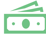
Revolving Loan Funds (RLF)