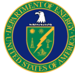
Department of Energy