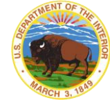
Department of the Interior