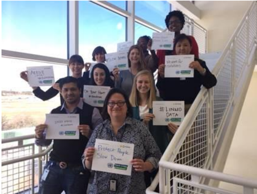
Pictured: DUIP Transportation Safety Team and policy team staff

info@unroadsafetyweek.org or download the campaign poster to share on your social media channels.