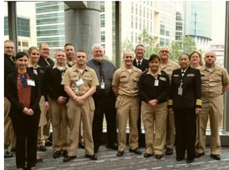
Pictured: Injury Prevention Specialists