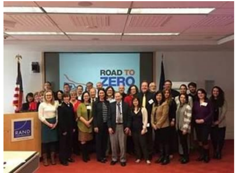
Pictured: Too many to name! Lots of organizations and experts coming together to address traffic fatalities.

In October, the National Safety Council, in partnership with the National Highway Traffic Safety Administration, the Federal Highway Administration and the Federal Motor Carrier Safety Administration, announced the Road to Zero initiative. Its aim: To eliminate traffic fatalities within 30 years. CDC has been participating and excited to see the momentum. Learn about past meetings and upcoming ones here .